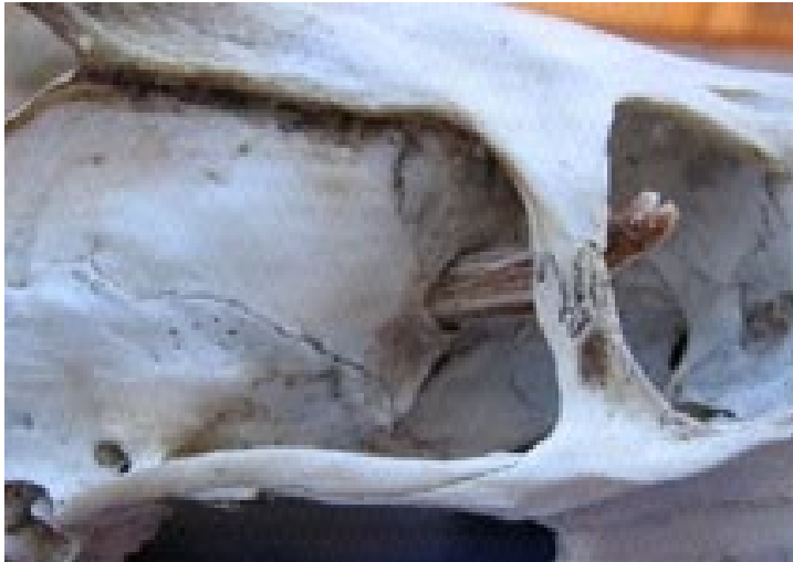
Figura 2. Posición en que quedó el asta al partirse, y en la que se encontraba al ser rescatado el animal.

comportamiento más agresivo hacia sus congéneres y cierta capacidad para provocar daño. Entre machos de pudú se producen vigorosos enfrentamientos cabeza a cabeza, topetazos, empujones y saltos dirigidos hacia el oponente con la ayuda de sus fuertes caderas (Geist, 1998).