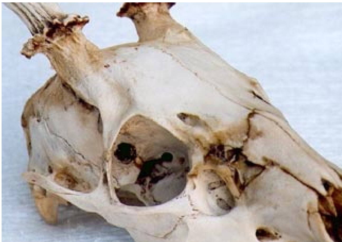
Figura 1. Orificio de 5 mm de diámetro dejado por el asta en la cavidad orbitaria derecha

trozo de asta tenía la punta quebrada y en el otro extremo, se partió muy cerca de la roseta.