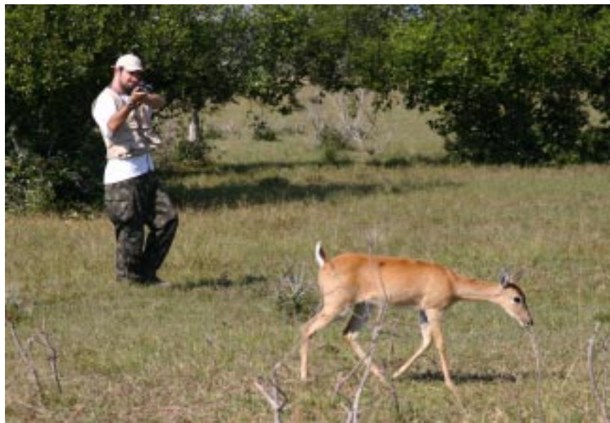
Figure 1 – Researcher during approach attempt to dart the pampas deer ( Ozotoceros bezoarticus ) in the Pantanal.

Once laid down on the ground, we weighted and checked its reflexes. Subsequently, after the complete chemical immobilization, we blindfolded and ear plugged the animals to reduce external stimuli and administered 0.5 mg of atropine sulfate intravenously. During the handling, deer was kept ventrally down to prevent rumen fermentation and received salt water solution on its eyes to prevent corneal drying. Puncture wounds were treated with antibacterial veterinary spray. In attention to the cooperative research between Embrapa and